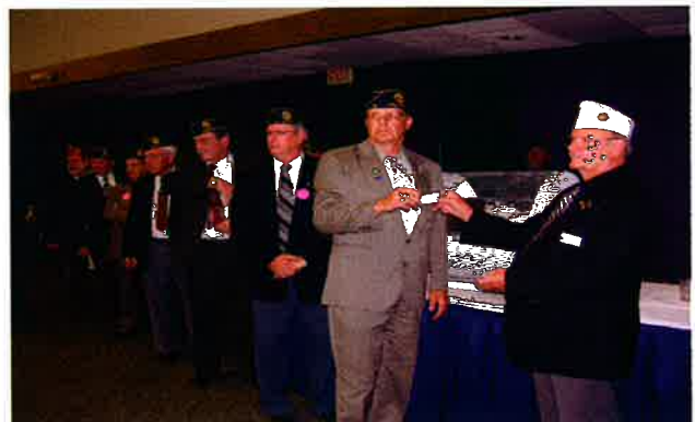
Past Commanders draw raffle winners.