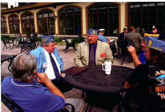
S.A.L guys take a break