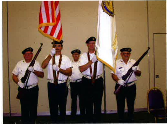
Color Guard at opening ceremony

< One of the beautiful buildings at Boyne Mountain.