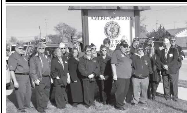
A stop at Post 389 During the 16th District Tour

I have personally been in conference calls with the National SAL Membership Team, looking forward to seeing everyone at winter Conference.