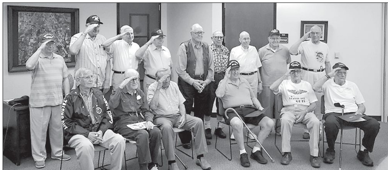
WWII Vets honored at township board meeting

Before the Holt Hometown festival at the township board meeting, 15 WWII veterans were presented proclamations of thanks for their service. The veterans were interviewed at The Sam Cory Senior Center for a public panel discussion. The Historical Society co-hosted this event and the video will be included in their historical archives. The vets were also the Grand Marshalls of the festival's Parade.