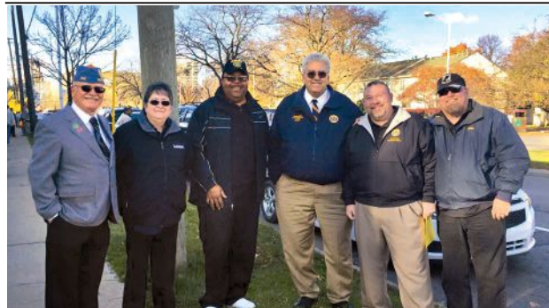
Waiting for the Veteran's Day Parade to begin.

HARBOR BEACH - The American Legion Auxiliary, Burhans Hagedon Unit 197, concluded the Veterans Day Project for 2015 at their monthly meeting on Tuesday, October 27. A total of 73 Lap Robes and 11 Wheelchair/Walker/Bed Rail Totes were proudly donated by members. The donated items will be delivered to the Ann Arbor Veterans Hospital to celebrate Veterans Day November 11, 2015. Thank you to all the members of the Auxiliary for their participation, American Legion Post 197 Harbor Beach & Department of Veterans Affairs/DAV Bad Axe for delivery of the donated items, and the community whose support and poppy donations helped in part to fund this project. We are forever grateful to all Veterans for their service.