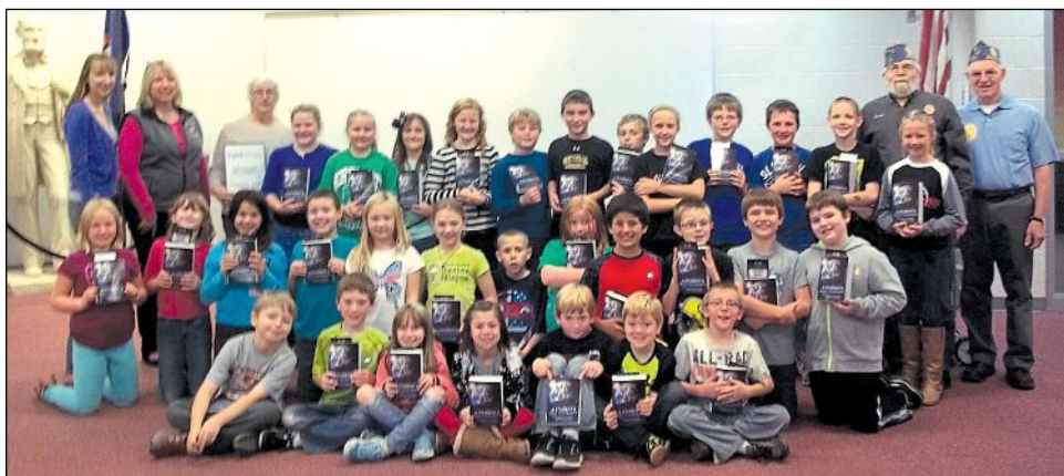
Dictionary Project at Forest Park in Crystal Falls