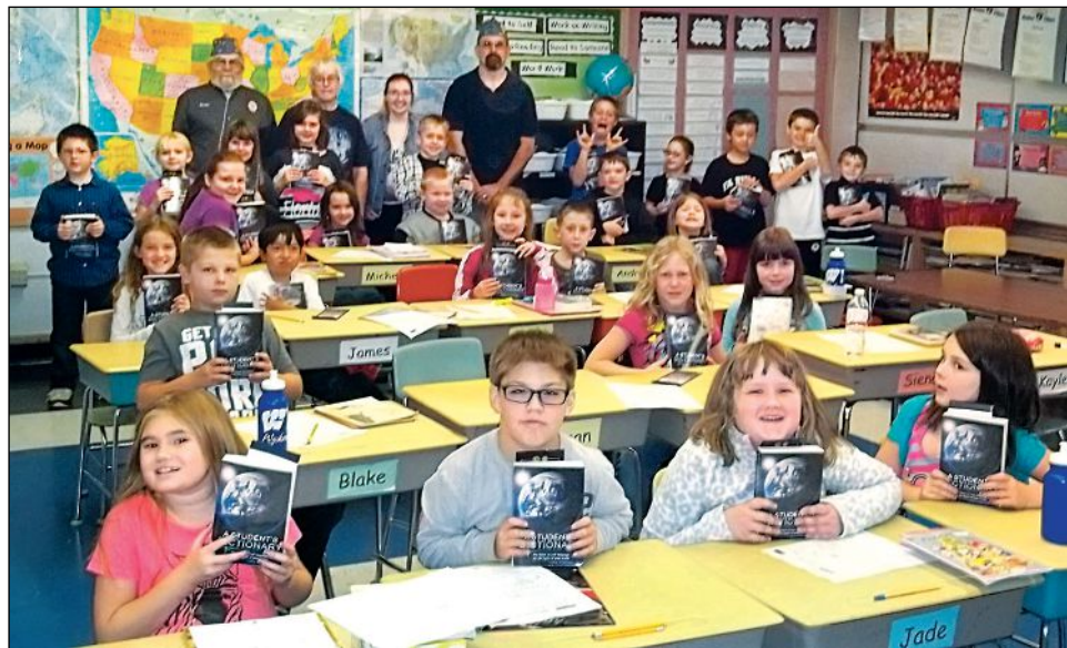
Dictionary Project at West Iron Elementary in Iron River