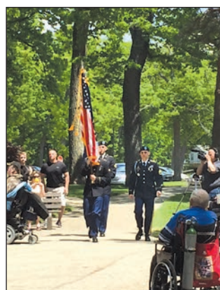
Memorial Day Celebration at the GR Veterans Home