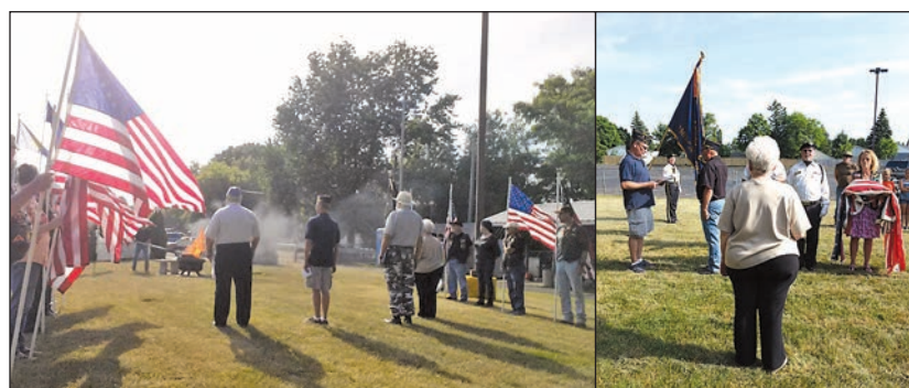
Post 298 perform a flag ceremony