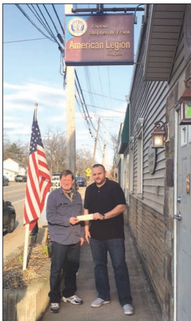
Haslett Post 269 Sons of the American Legion presents $1,000 donation to the Injured Soldiers Organization. the I.S.O. provides recreation opportunities, free of charge, to wounded military veterans of all eras as a "Thank You" for their service, and to aid in the recovery from physical and emotional injuries sustained during conflict deployments. In addition to their commitment to Veterans and their community, the S.A.L. Post 269 Squadron recently shipped 50 "Care Packages" consisting of snacks, toiletries, socks, and other goods to the unit of a soldier from their community currently serving in the Middle East