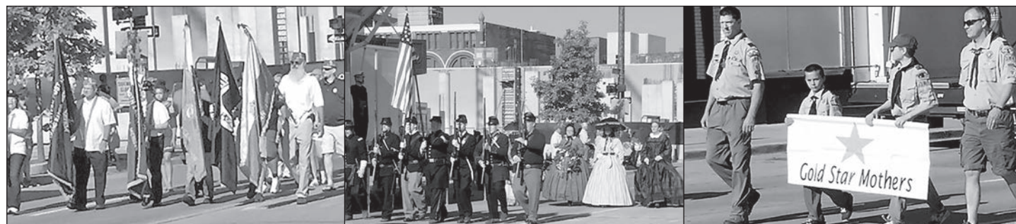
Grand Rapids Memorial Day Parade