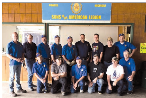
SAL Squadron 244 in Powers, MI on June 4, 2016 served over 300 Legion riders at Veterans Memorial park in Powers. All riders were very pleased how the event went. This was the second year doing this. It is a wonderful experience giving back to our Veterans.