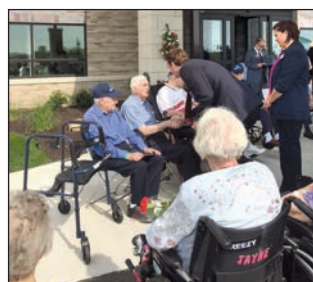
At First & Main of Metro Village pinning ceremony to Veteran residents by State Representatives