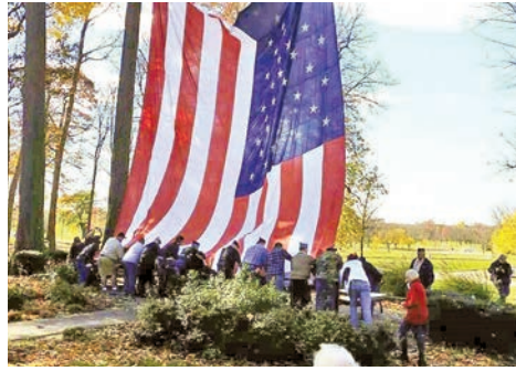
Eric Nelson American Legion Post 258

Every year the Grand Rapids Home for Veterans takes the 30' by 50' US flag down in November. This saves it from the harsh winter weather. It is raised in May prior to Memorial Day. Some residents of the veterans home expressed concern about a lack of respect given due to the limited number of personnel available to lower the large U.S. flag and store it for the winter.