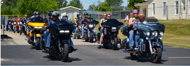
With over 50 riders, Jackson Post 29 Riders held its first (hopefully annual) motorcycle poker run to raise money for Michigan's Boys State & Girls State programs. They raised over $1200 in sponsorships.