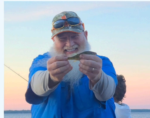
There are no small fish, only small fishermen! Henry Van Dusen