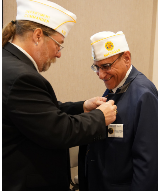
Retiring Commander Avie

https://michiganlegion.org/2026-department-convention-battle-creek/