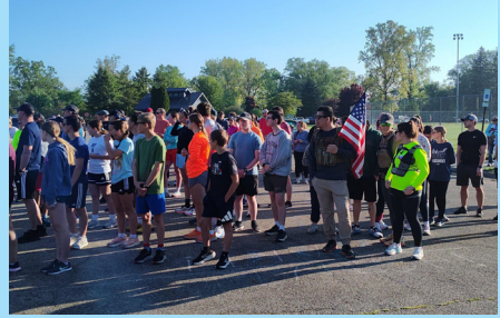
Their first ever Memorial Day 5K/2K held at Island Park, as well as providing Honor Services at Riverside, Calvary, and Memorial Gardens cemeteries with ceremonies all around Mt. Pleasant.