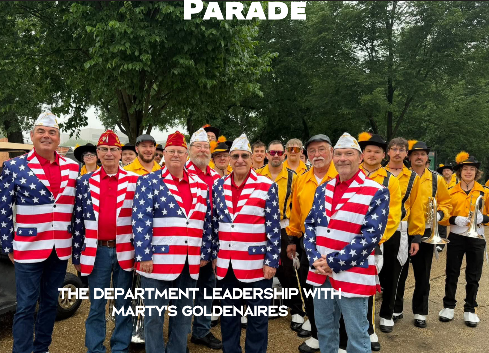
THE DEPARTMENT LEADERSHIP WITH MARTY'S GOLDENAIRES

Make sure you send in your Summer Convention Raffle Tickets for your chance to WIN $5000! Drawing June 22!