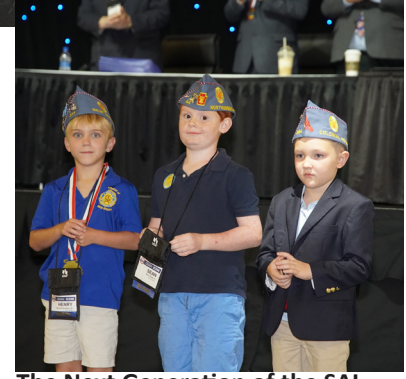
The Next Generation of the SAL